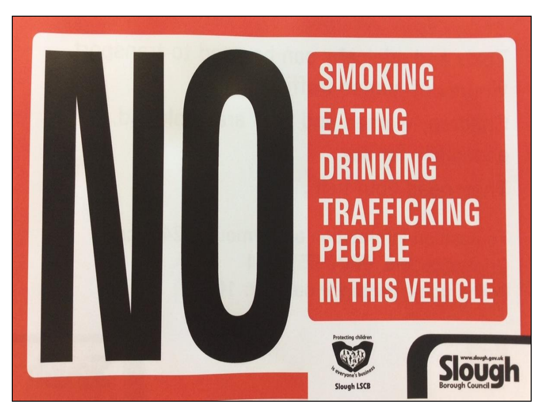
SOMETHING Sexual exploitation is abuse and a crime.